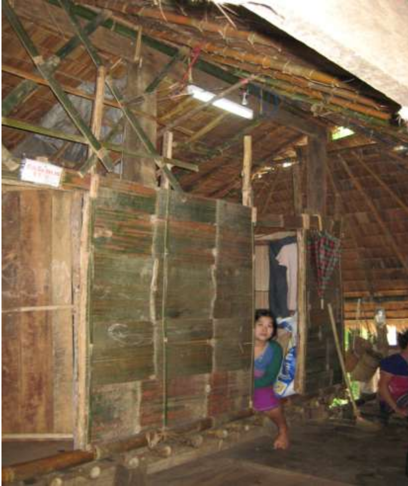
Figure 4. Lights in Remote Jungle Health Clinic Provided by Small Hydro Generator