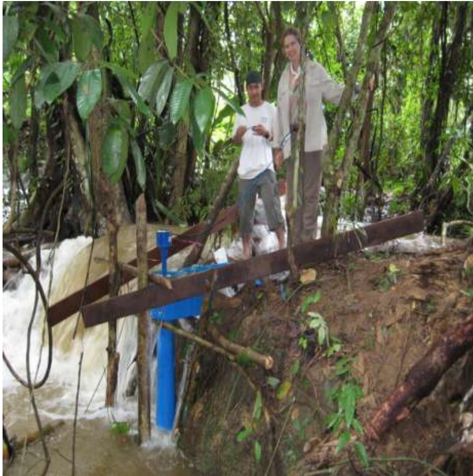
Figure 3. Installation of Small Hydro System

provided tools and training on basics of electricity and safety, and demonstrated the installation of the hydroelectric turbine (Figure 3) and wiring of a health clinic (Figure 4). In March of 2010 another seven generator systems were ordered and shipped to Bangkok, and four additional teams were trained on installation and operation of the hydroelectric generator and hut electrical systems. In total, seventeen generators have been installed and ten teams of local individuals are responsible for their operation and maintenance