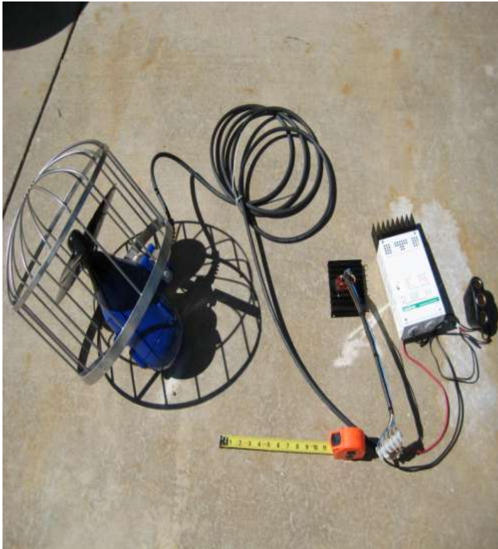
Figure 5. In Stream Hydroelectric Generator System

5. It is a derivative of the technology used for recharging batteries on sailing yachts. Made in England by Ampair 2 , it is rated at 100 watts, 8 amps, and weights 11.4 kg (25 lbs). It is made to be dropped into relatively fast moving stream (1.8 meters per second [4 mph] or more). The main drawback is these generators are expensive – systems approach $2,500US delivered, too expensive for extensive use in developing countries. These in stream generators scheduled to be demonstrated and evaluated on the Thai/Burma border in late summer of 2011.