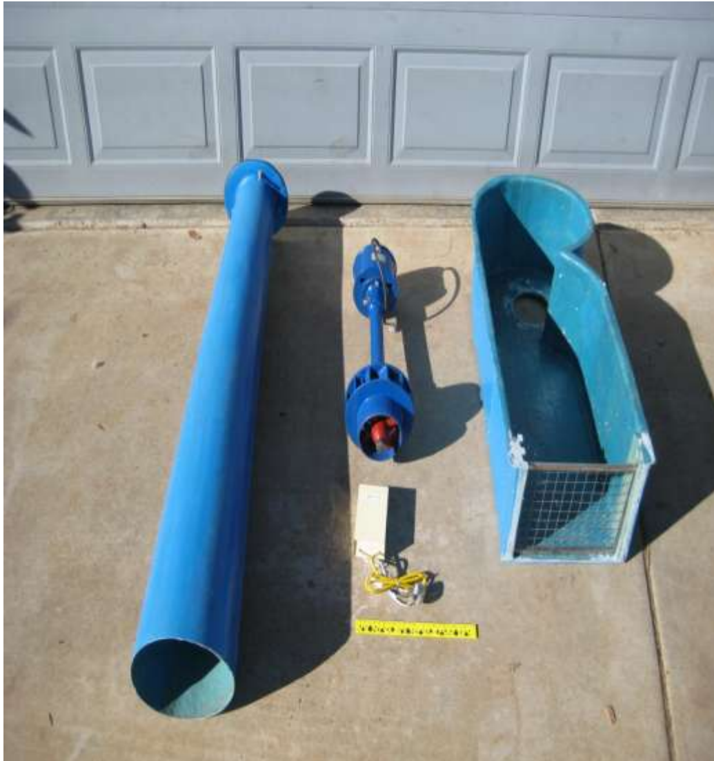
Figure 2. Components of Small Hydro System

The system consists of: an alternator/generator and turbine, a water intake canal, a water outlet pipe (suction tube), an electronic load controller, and a heat sink (Figure 2).